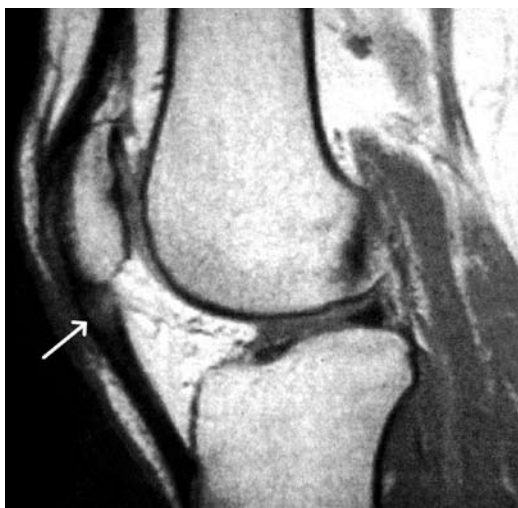
Figure 3. Magnetic resonance image of the female volleyball player diagnosed with jumper's knee.

Pain as the basic symptom and a decreased functional ability of the afflicted lower extremity is a characteristic clinical picture of the jumper's knee. The functional inability of the afflicted lower extremity is accompanied by intense pain and shows a range from slight to complete inability to participate in athletic activities. The most common site of tendinitis is around inferior pole of patella (34). Pećina et al (35) reported the appearance of pain at the insertion site of the patellar tendon at the tip of the patella in 80% of athletes suffering from jumper's knee (Figure 3). In very rare