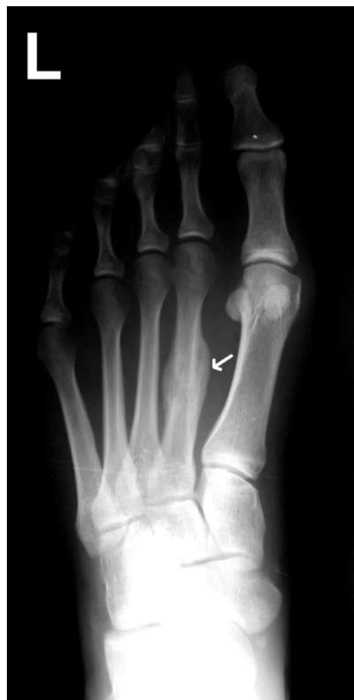
Figure 2. Stress fracture of the second metatarsal bone.

Lower-extremity bones are most commonly affected, but stress fractures also occur in non-weight-bearing bones such as upper extremities and ribs. The tibia is the most commonly involved site for both men and women, but the fractures of the femoral neck, tarsal navicular, metatarsal, and pelvis are seen more commonly in the female athlete (25) (Figure 2). Evidence shows that cer-