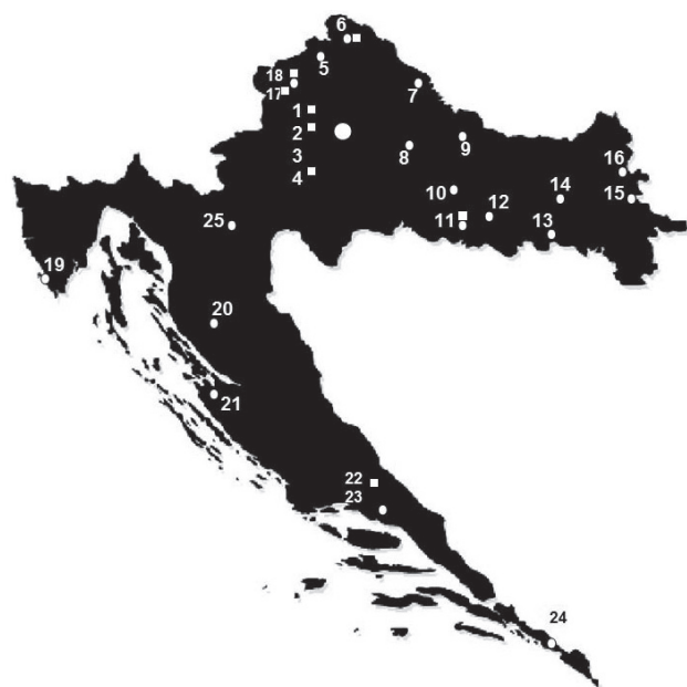
Fig. 1. Map of Croatia showing 12 hospitals and 13 Institutes of Public Health

CHC Zagreb-1, GH Sv.Duh Zagreb-2, CH Dubrava Zagreb-3, IPH Zagreb-4, IPH Varaždin-5, IPH Čakovec-6, GH Koprivnica-7, IPH Bjelovar-8, IPH Virovitica-9, GH Pakrac-10, GH N. Gradiška-11, GH Požega-12, IPH Sl.Brod-13, GH Našice-14, GH Vukovar-15, IPH Osijek-16, IPH Zabok-17, GH Zabok-18, IPH Pula-19, IPH Gospić-20, IPH Zadar-21, GH Split-22, IPH Split-23, IPH-Dubrovnik-24 and GH Ogulin-25.