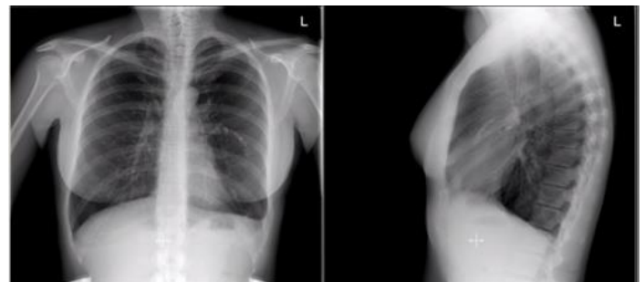
Figure 3. Postembolization chest x-ray showing six embolization coils with complete resolution of pleural effusion.