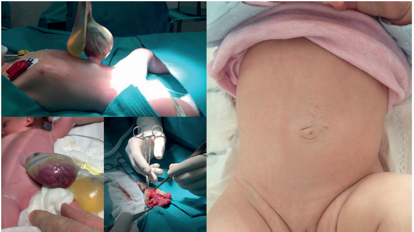
Fig. 1: Umbilical cord hernia.