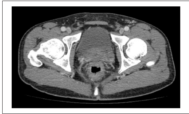
Figure 2. MSCT of the pelvis shows circularly thickened rectal wall with blurred surrounding fatty tissue.

A 33-year-old HIV-infected patient was admitted to our hospital in September 2015. He was complaining about purulent and bloody anal discharge, slight RUQ pain, and low-grade fever that had started a month ago. A few days prior to his admittance to the Unique Health Identification (UHID), he noticed redness, swelling, and pain in his right heel. He had been on tenofovir/emtricitabine and efavirenz since HIV was diagnosed in October 2013. He acquired HIV infection through sex with other men (men who have sex with men (MSM)). His last CD4+ count in May 2015 was >500/\text{mm}^3 and viral load (VL) undetectable. He stated that he had had an unprotected receptive anal intercourse few weeks prior to the onset of symptoms. On admission, the patient had a fever of 37.8^\circ\text{C} , he was pale, and ill-appearing. There was noticeable redness and swelling below the lateral malleolus of the left ankle. On abdominal palpation, RUQ tenderness was noticed, without liver enlargement. The digital rectal exam showed purulent and bloody discharge. Laboratory test showed moderately elevated CRP 77\text{ mg/L} , with normal complete blood count, biochemistry and liver function tests, urinalysis, and chest X-ray. Two sets of blood cultures for routine bacterial cultures were taken, as well as throat and rectal swabs for NAAT for C. trachomatis and N. gonorrhoeae . The patient was initially given intravenous ceftriaxone 1 g QD, oral doxycycline 100 mg BID, and indomethacin 25 mg TID. An