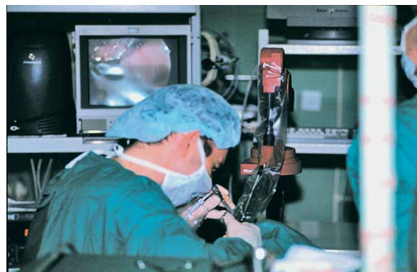
Fig. 2. Virtual endoscopy and tele-virtual endoscopy overcomes some difficulties of conventional endoscopy. In classical endoscopy an endoscope is inserted into the patient to examine the internal organs or spaces. The physician uses an optical system to view interior of the body.

as the user moves, so that up-to-date visualization is always shown on the computer screen 6 (Figure 2). Such a preoperative preparation can be applied in a variety of program systems that can be transmitted to distant collaborating radiological and surgical work sites for preoperative consultation as well as during the operative procedure in real time 6 .