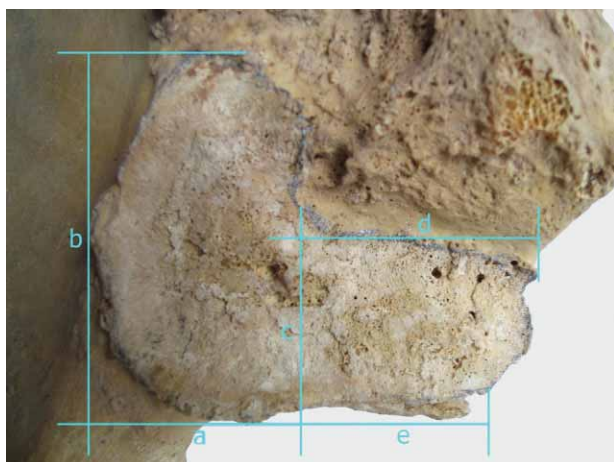
Fig. 2. Facies auricularis of the pelvic bone with measured parameters. a – width of vertical part, b – height of vertical part, c – height of horizontal part, d – cranial width of horizontal part, e – caudal width of horizontal part.

It was necessary to take more parameters besides the surface area, because of relatively large variety of shapes, so just the value of surface was not enough to create an image of facies auricularis , and especially it didn't pro-