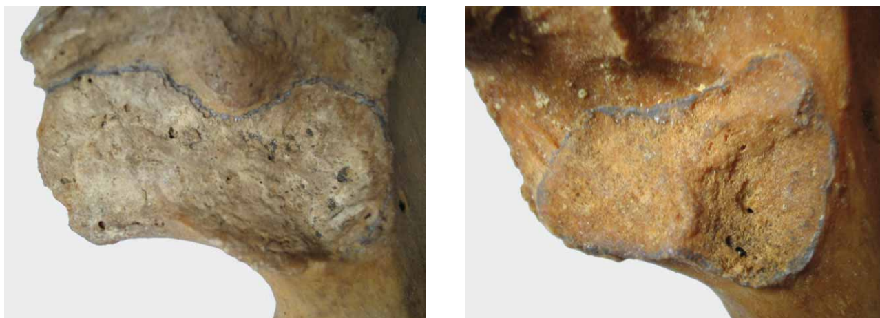
Fig. 1. Pelvic bone – facies auricularis .

tocks in approximately 15% of the population 5,6 . This pain doesn't have to be caused by some pathological change in the joint itself. Still, there is no reliable clinical method that could define stability of this joint 7 . Many radiological methods for defining pathological changes of this joint have been already described. But X rays can be as hurtful as useful for the patient so it is very important to use them as rarely as possible. That is why it is necessary to know the basic anatomy and biomechanic of this joint. The microscopic anatomy of this joint has been well researched, but for understanding the transfer of the forces it is important to know precise size of the surface of the joint's contact area, which is the goal of this study. It is important for simulations of the walk, results of biomechanical analysis and calculations of the transfer of the forces from the spine to hip joint.