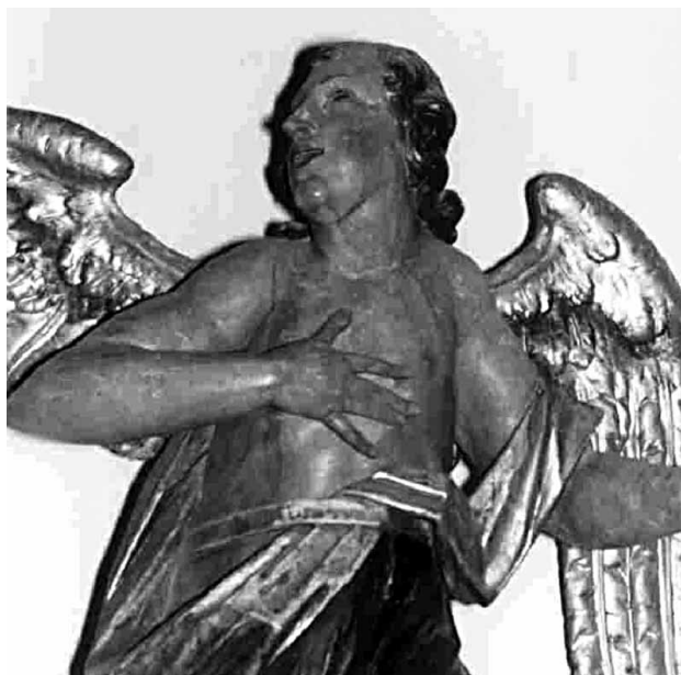
Fig. 2. Angel with goiter in the local church near the village of Rude, where 85% of the children had goiter in 1950'.

At the beginning of the 1990's The National Committee for Eradication of Goiter and Control of Iodine Prophylaxis was founded. The Committee initiated a comprehensive epidemiological research with the aim of determining the state of iodine intake in different parts of Croatia 5,6 . A part of the nationwide survey was carried out in the village of Rude 6 . A total of 200 schoolchildren were included in the village survey (110 boys and 90 girls). The prevalence of goiter among schoolchildren was determined by palpation of the neck according to the PAHO/WHO classification 7 . Urinary iodine excretion was measured by the instructions of ICCIDD/WHO and modified colometric method based on the Sandell-Kalthoff reaction 8 . The results of the investigation demonstrated that iodine deficiency in the village still persisted. Goiter was detected in 26% of schoolchildren aged 7–11 years ( n=88 ) and in 43% of schoolchildren aged 12–15 years ( n=112 ). The urinary iodine excretion in those children ( n=118 ) varied between 0.5–19 \mu\text{g}/\text{dL} with a median of 7.4 \mu\text{g}/\text{dL} . Only few were distinctly low and 30% were below 5 \mu\text{g}/\text{dL} , while 80% were below 10 \mu\text{g}/\text{dL} . The overall prevalence of goiter in the village was 35% 6 .