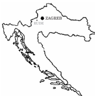
Fig. 1. Geographic location of the village of Rude.

In the past, the village was well-known area of severe iodine deficiency, and therefore the object of many epidemiological investigations. Endemic goiter was the most common disease of the village population. In 1952, distinguished Croatian endocrinologist Professor Josip Matovinović carried out detailed village survey 2 . The goiter was detected in 83% of 865 individuals with increasing prevalence with age. Goiter prevalence in schoolchildren and adolescents was 85.0%. It was the place with the highest prevalence of goiter in Croatia before the introduction of compulsory salt iodination in former Yugoslavia in 1953. Professor Matovinović 3 gave detailed description of the life in the village at the beginning of the 1950's: »The houses were small and over-crowded, with an average of five family members per household. The essential dietary products were corn bred, potatoes and beans, with little meat or milk. Wine was an important source of calories – 7.4% drank more than one liter per day, and 83% of children consumed alcohol«. A young girl