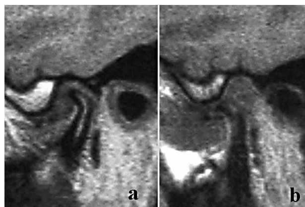
Fig. 2. MRI showing TMJ of a 23-years old asymptomatic female person: hypoplastic condyle, deformed form of DD (a, closed mouth) without reduction (B, open mouth) with condylar hypomobility.

disc were the most common findings. The proportions of almost identical frequencies were determined in the patients' TMJs, both the right and left TMJ. Although frequency rates were lower in a number of the TMJs, moderate to severe forms of structural bone changes of the