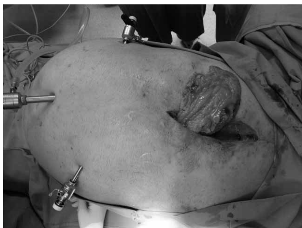
Fig. 2. Reposition of omental flap.