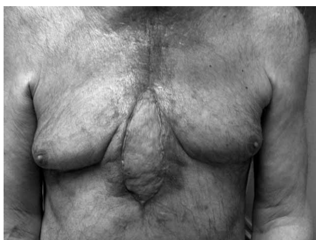
Fig. 4. Patient 1 after six month follow up.