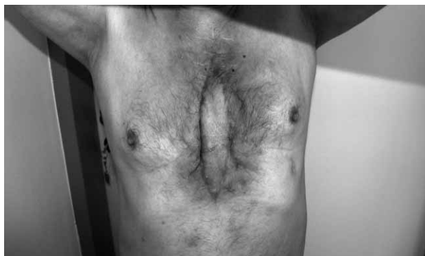
Fig. 5. Patient 2 after four month follow up.

construction was 20 days. Both patients recovered completely (Figure 4 and 5).