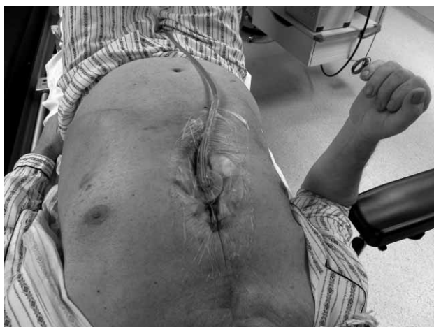
Fig. 1. Patient after sternotomy and VAC application.

Postoperatively, patients were transferred to the intensive care unit (ICU) and had an average ICU stay of 10 days. The average length of stay following omental re-