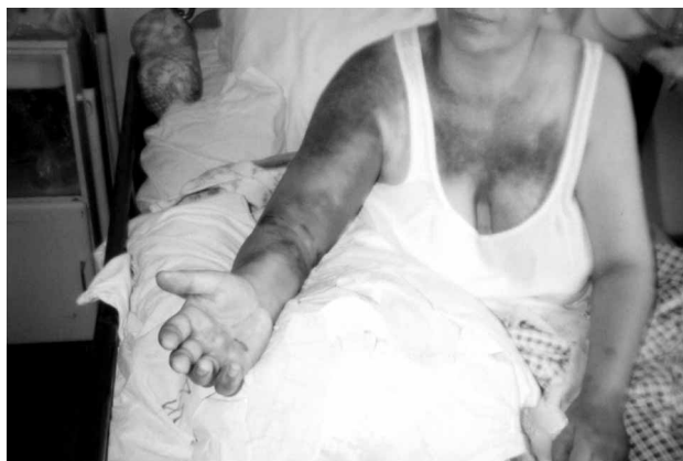
Fig 4. Hump-nose viper bite on the right hand in a 36 year-old female. Oedema, discoloration of skin and ecchymosis of the whole arm and part of the torso.

increased serum creatinine). A total of 8.2% had developed oliguria. Liver function impairment was recorded in 5.0% of cases, with increased bilirubine and liver enzymes, and decrease serum fibrinogen. Neurotoxic symptoms with cranial paresis and paralysis was recorded in 17.9% of cases, most commonly affecting oculomotor nerve with ptosis.