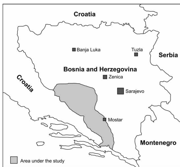
Fig 1. Area under study.

Snakebite reaction in patients was classified according to the Reid and Perssons's scheme 15,27 . Three stages of the clinical presentations were assigned: mild, defined as the patients with only local changes at the bite location; moderate, those with severe local reaction, moderate general symptoms and mild changes in the laboratory findings combined with less than two hours of shock, and finally severe, characterized by the severe local presentation, and severe clinical presentation and laboratory findings and shock that lasted over two hours. Shock was defined as tachypnoea, perspiration, cyanosis, low blood pressure, confusion and loss of conscious 28 . We also recorded every case of disseminated intravascular coagulation 29,30 .