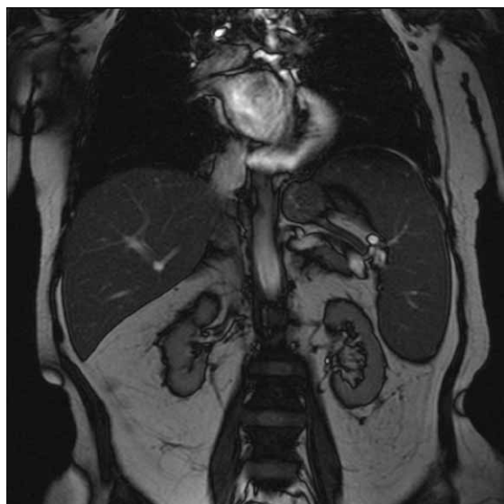
Fig. 4. Magnetic Resonance Imaging (MRI) finding of splenomegaly.