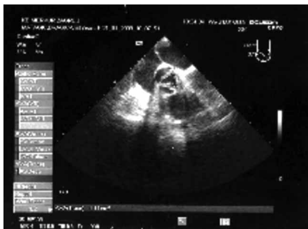
Fig. 1. Echocardiography of aortic valve.

We report a female patient, with unremarkable family history and no previous medical history until the age of 30, when she presented with exertional dyspnea and syncope. Physical examination at that time revealed only abnormal heart sounds – murmurs compatible with aortic valve insufficiency. During next years of cardiological follow up, echocardiography revealed fibrotic changes of the