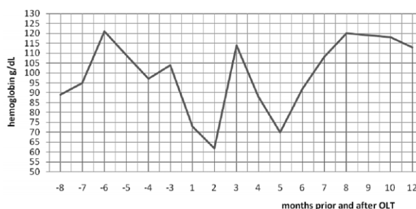
Fig. 2. Hemoglobin levels pre- and post-OLT. Therapy with red blood cell transfusions and repetitive IVIG cycles (0,4 g per kg) resulted in recovery of erythropoiesis demonstrated by monitoring hemoglobin levels during 1-year follow-up period.

Anemia is a frequent problem after LT, with its heterogeneous etiology it can be presented as hyper-regenerative due to blood loss or haemolysis or hypo-regenerative due to myelotoxic drugs or infectious agents or combination of both types. One of hypo-regenerative anemias is a pure red cell aplasia (PRCA) characterized by the inhibition of erythropoiesis in bone marrow. It can be heredi-