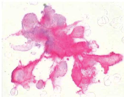
Fig. 3. Hepatic epitheloid hemangioendothelioma cells – positive immunostaining to CD34 (LSAB).