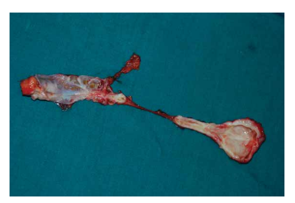
Fig. 3. Post-operative specimen showing the blind-ending ureter (on the right side) and the seminal vesicle containing small calculi (on the left).

When performing a surgical excision of a blind-ending ureter one should be careful not to enter the normal ureter. Although we were very cautious during the operation and did not detect visible damage of the normal