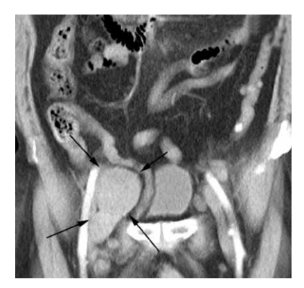
Fig. 1. Coronal CT image of a lymph node package (arrows) indicative of malignant dissemination of the previously documented known prostate cancer.