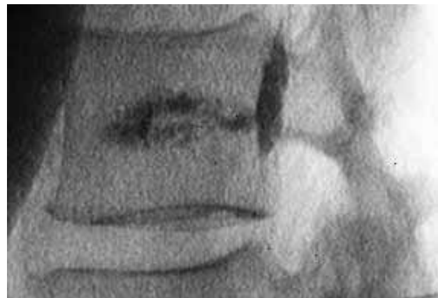
Fig 2. The cement leakage into basivertebral veins marked by arrow.

Through a small skin incision, an 11-gauge needle for bone biopsy is placed in the centre of pedicle in AP and then, it is followed-up on diascope and inserted, in LL direction to the first third of the vertebral body. Once we are satisfied with the needle position, cement of relevant viscosity is applied in the vertebral body. Diascopy is very important during the whole process of the cement application in order to notice its leakage and stop applying the cement on time to prevent more serious complications. LVC (Vertebroplastic, Depuy Acromed), and HVC (Confidence, Depuy Spine) were used.