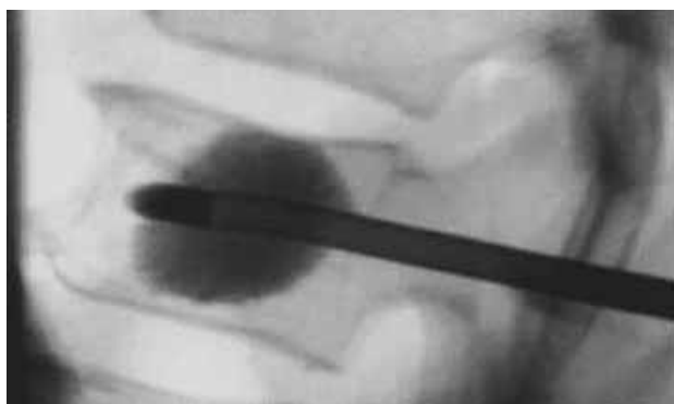
Fig 1. X-ray of lumbar vertebral in lateral projection taken after application of cement showing good position.

All surgeries were performed by one surgeon under local or general anesthesia, if they could not tolerate the local one. Surgery is carried out in a prone position, the fractured vertebra is located by means of diascopy, the operation area is washed and covered, and the ski and subcutaneous tissue is anesthetized with lidocaine when applying local anesthesia