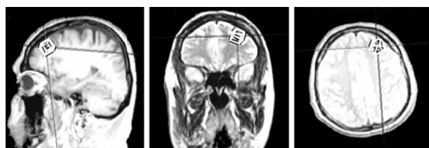
Fig. 1. Spectroscopic Volume of Interest (VOI) in the dorsolateral prefrontal cortex.

From a total number of 28 subjects discussed here, 11 could be considered as early to intermediate responders